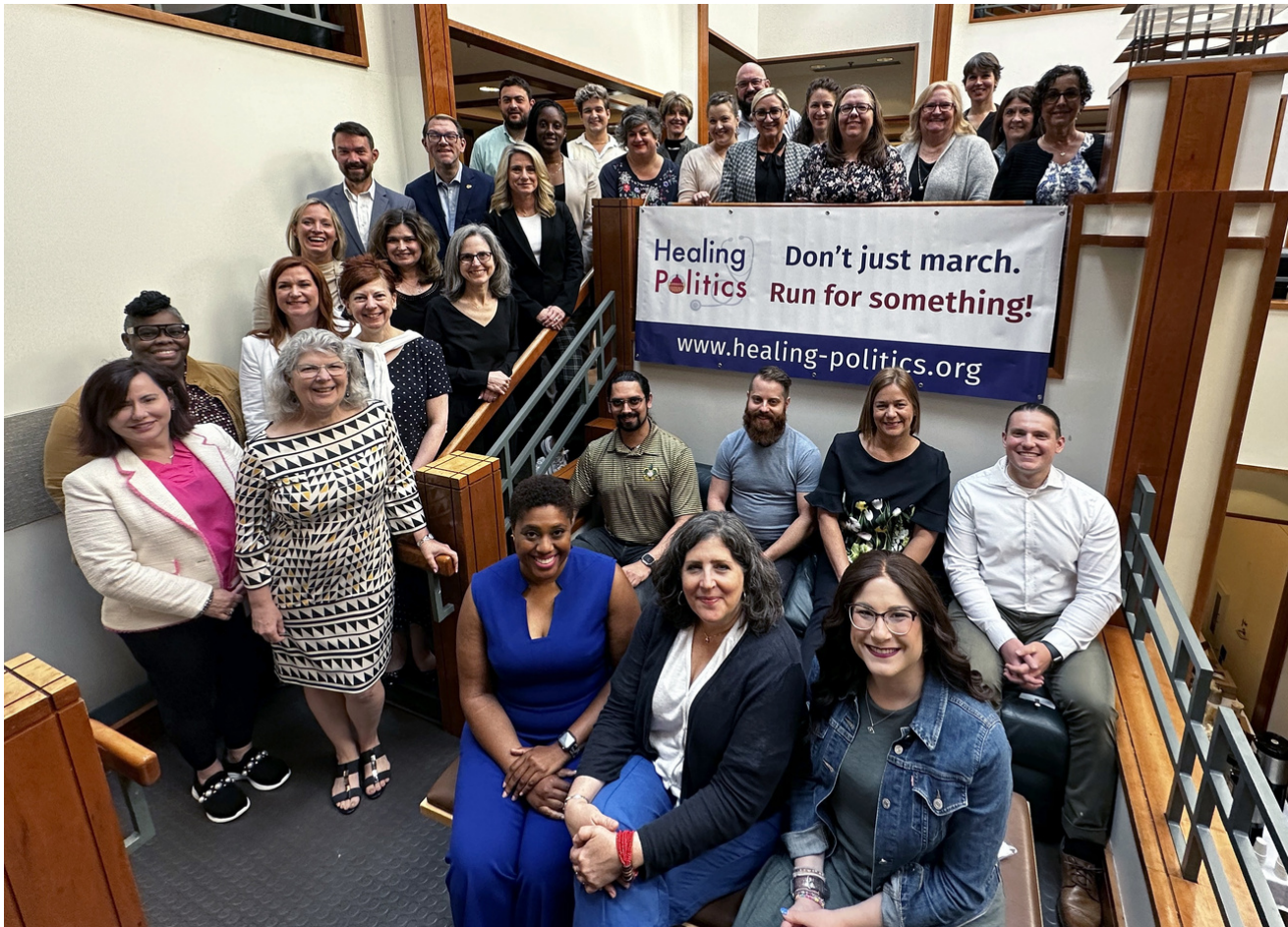
Above: Students and Organizers of the Healing Politics Campaign School

Polis: Center for Politics and Healing Politics hosted an inaugural Campaign School for Nurses & Midwives at Duke University.