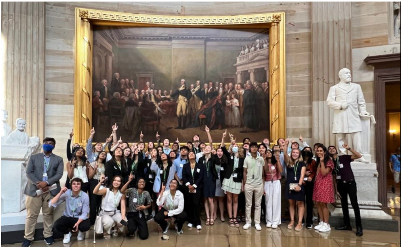
Above: Project Citizen students inside the U.S. Capitol Building

During the D.C. programming, students had the opportunity to visit the U.S. Capitol Building, Oxfam headquarters, Embassy of the Republic of Armenia, and the Embassy of The Kingdom of Saudi Arabia.