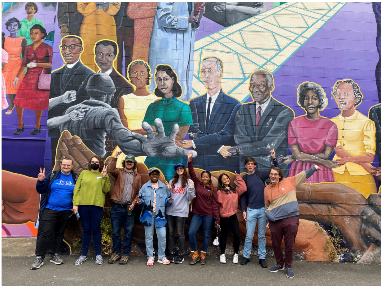
Above: PSC Members on the Durham Civil Rights Walking Tour