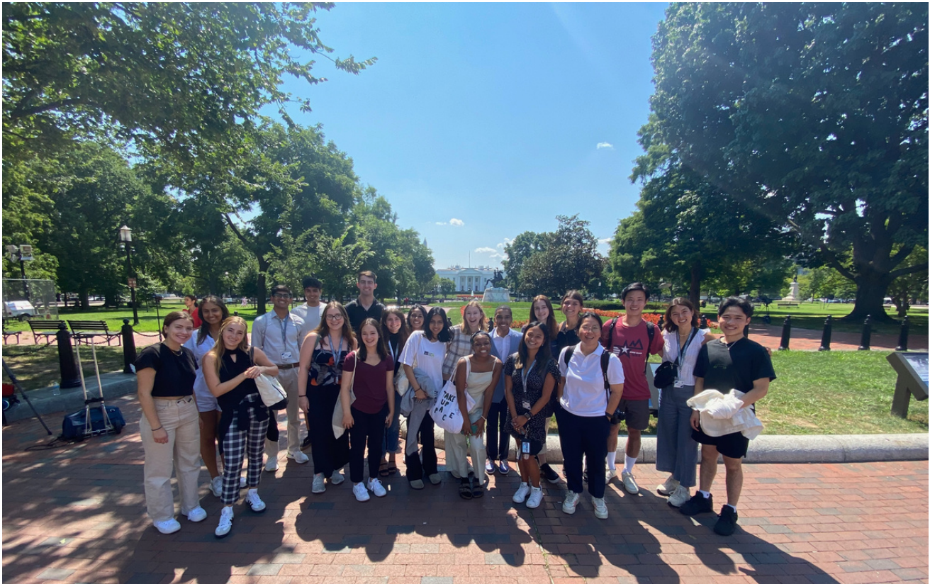
Above: Project Citizen students in front of the White House