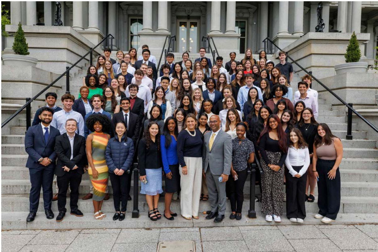
Above: PUBPOL155, 301, and PSC students and faculty at the Eisenhower Executive Office Building, Washington D.C.