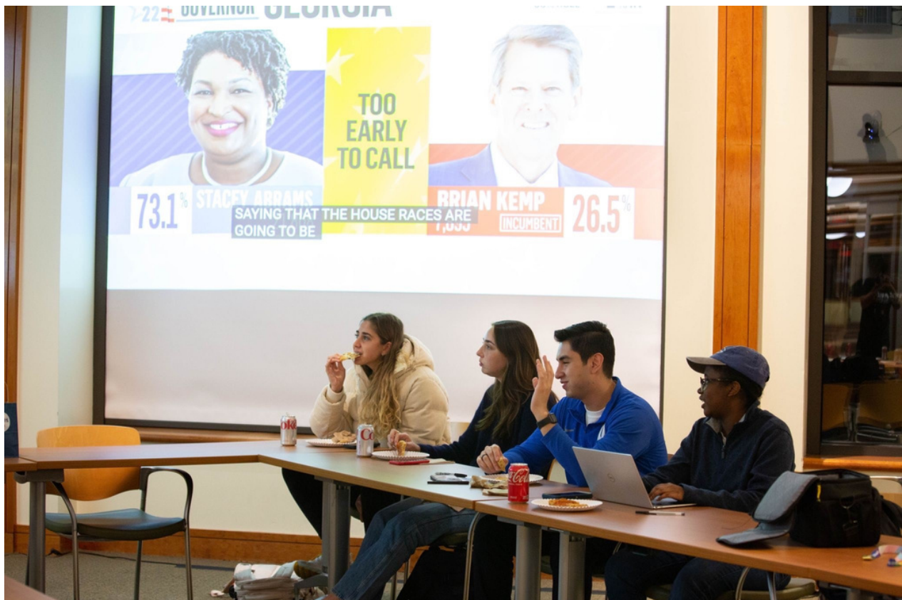
Above: Polis Student Committee students at the Midterm Election Watch Party

Healing Politics Campaign School For Nurses & Midwives