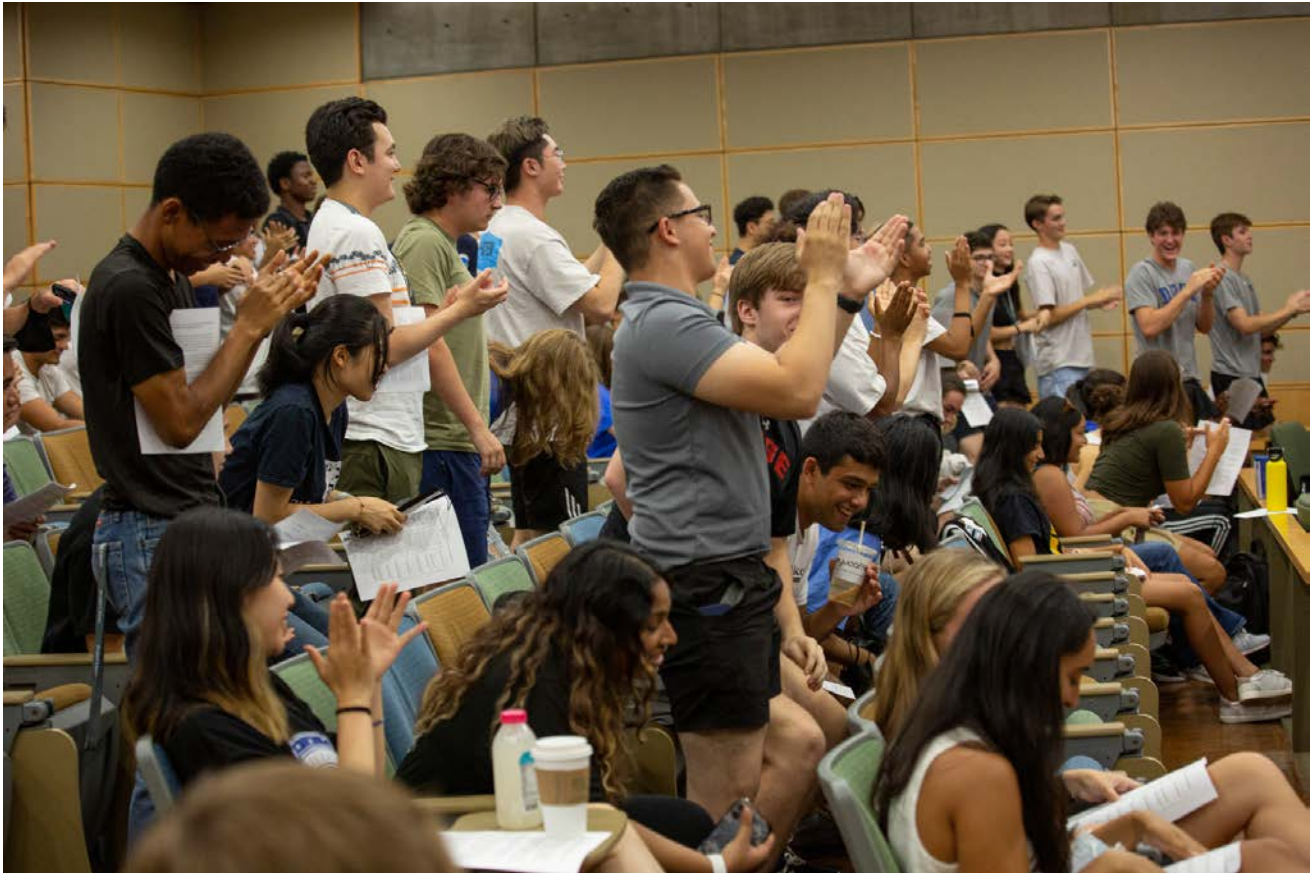
Above: Project Citizen students at the closing session