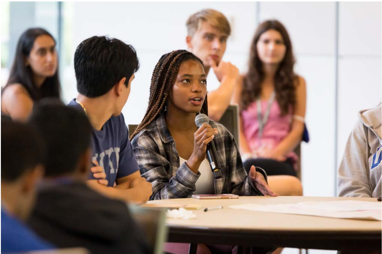
Above: Students at a Project Citizen workshop